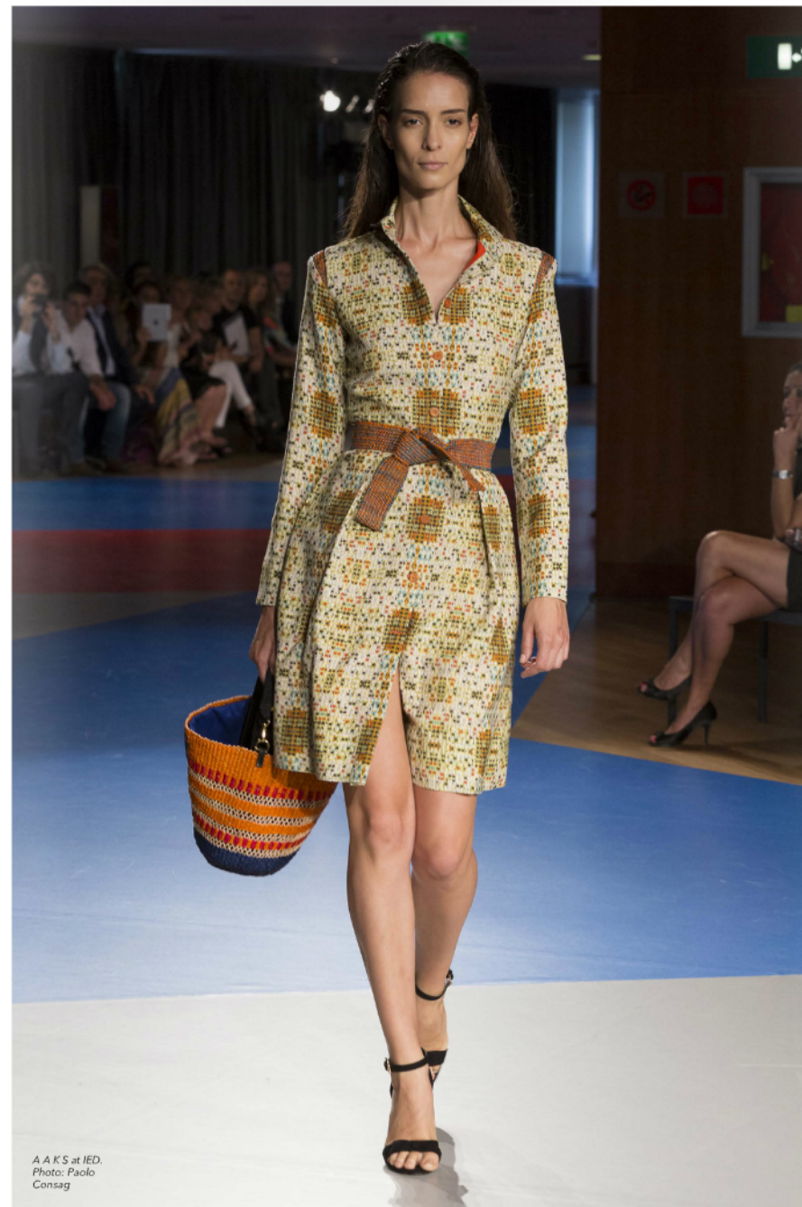
A A K S at IED.